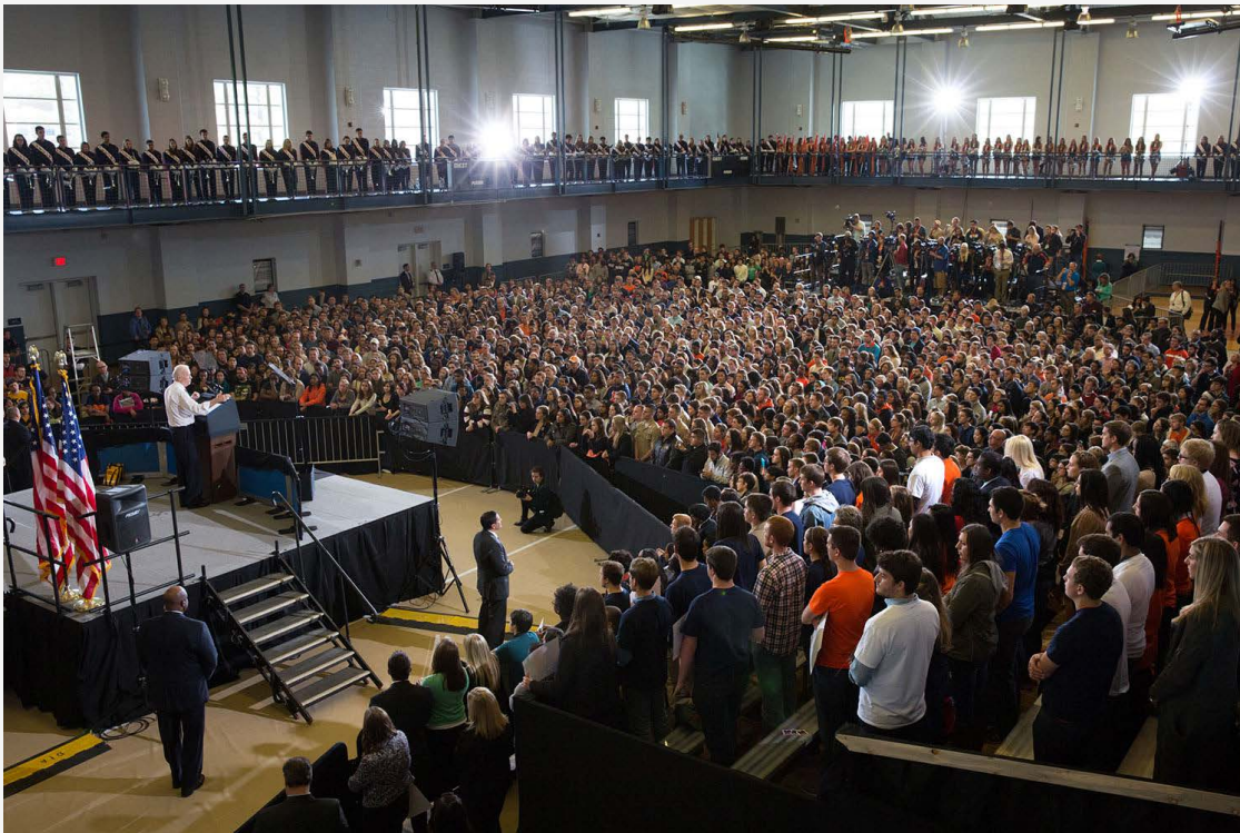
Vice President Joe Biden delivers remarks on campus sexual assault, at the University of Illinois, in Urbana, Illinois, April 23, 2015.

Summary: Vice President Biden attends a rally held at the University of Illinois at Urbana-Champaign (UIUC) to address the travesty of sexual violence on our nation’s college and university campuses.