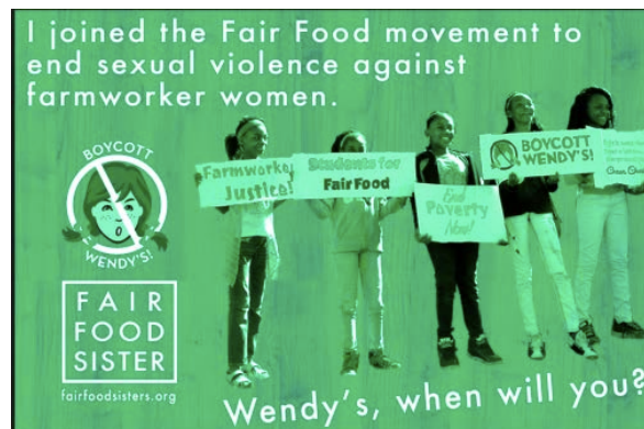
Image of the Fair Food Sisters Twitter movement to end sexual assault against farmworker women. 41

For decades, the women who harvest fruits and vegetables in the U.S. have endured sexual violence in the fields. A 2012 study conducted by Human Rights Watch indicates “80% of female farmworkers report facing sexual harassment on the job.” 39 Women are often fired for speaking up against sexual violence in the workplace while the abuser remains on the job. In 2015, the Equal Employment Opportunity Commission announced a $17 million judgment against Moreno Farm Florida and in favor of farmworkers who were regularly groped, prostituted, and raped by the farm owners’ two sons and a third supervisor. 40 The lack of incentives and aid provided by the government to victims of sexual violence in the field perpetuates their inability to seek redress and allows these abuses to remain in the dark, while offenders escape liability for malicious crimes.