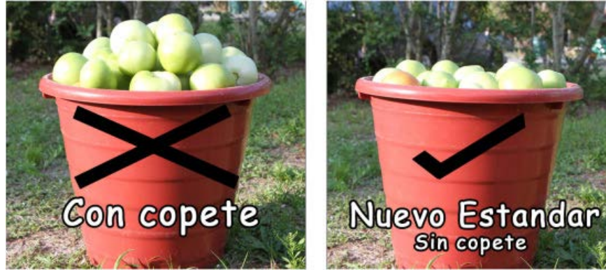
Image showing the new standards eliminating copete requirements implemented in farms participating in the FFP. 38